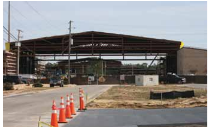
table in the 33rd Fighter Wing to the test mission that goes on for Air Force weapons testing, up to and including a phased array radar at one end of the complex that tracks space debris and is a national asset. From a training perspective for future air crew and maintainers, this affords a spectrum of opportunities to interact with organizations, services, and capabilities without having to wait for big exercises or even wars.

COL Tomassetti: Eglin is unique. I've heard it said in several briefs since I've been here that if you count the land ranges and the over-water ranges that Eglin has purview over, it makes it the largest military base in the world. The tenants at Eglin include representatives from all the U.S. services and a variety of missions—everything from special forces to the training mission that we bring to the