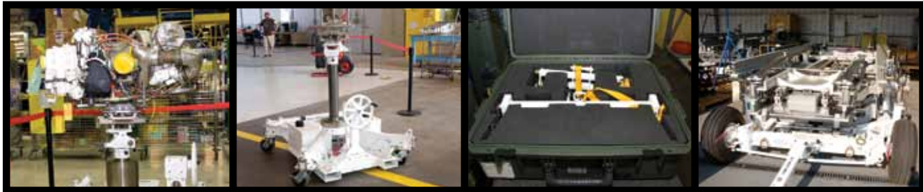
Integrated Power Plant