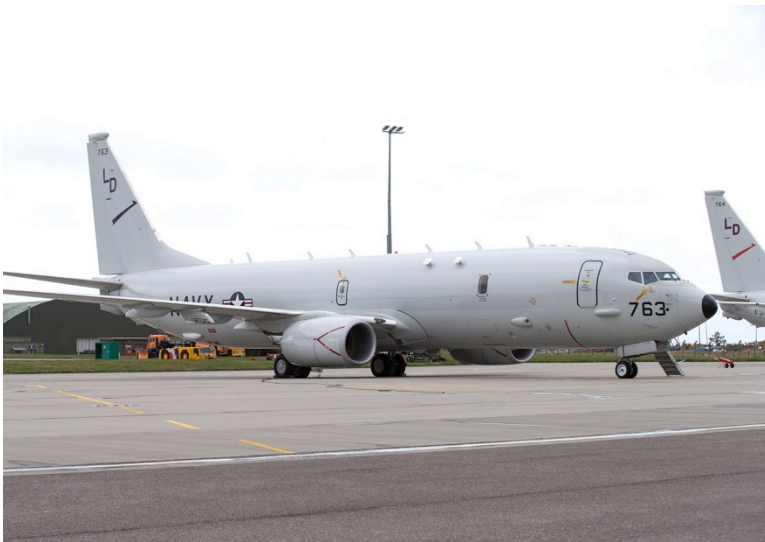
FIGURE 5 P-8 AT JOINT WARRIOR EXERCISE 2016 AND SEEN AT RAF LOSSIEMOUTH.

Norway is interested as well in the P-8 which then create a significant interlocking force. For Norway, because the P-8 is not a P-3, they would benefit from seeing much deeper into the maritime space to protect their interests. It is not just about flying to an area of interest and patrolling it. When you take off with the P-8 you link into the data network and are on station when you take off.