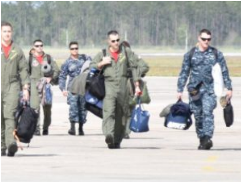
FIGURE 6 VP-16 HOME FROM DEPLOYMENT, 2016.

We were having difficulty with our media, and the P-8 is very media dependent; if the media is not working properly, the plane is not going to work properly.