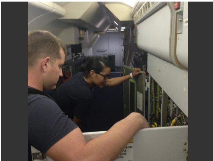
FIGURE 12 WORKING ON THE P-8.

It will be all the more challenging as it will be done in a down budget environment.”