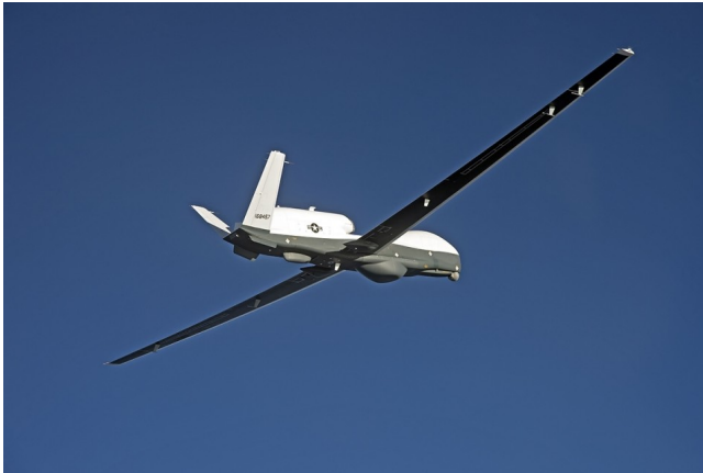
FIGURE 4 TRITON IN FLIGHT.

We're finding that the aircrews are making that leap with really no issue.