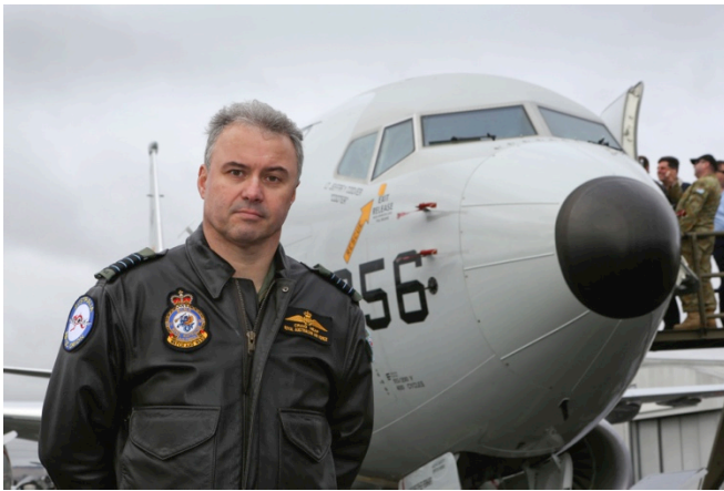
FIGURE 16 THEN THE OFFICER COMMANDING NO. 92 WING, GROUP CAPTAIN CRAIG HEAP, STANDS BEFORE A USN P-8 ON THE FLIGHT LINE AT EDINBOURGH.

We need to have open system architectures with the flexibility to spirally add capabilities at speed, not be hamstrung by a 5-year acquisition cycle. If ISIS has an acquisition cycle, and I believe it does, it certainly isn't as limited as our previous processes.