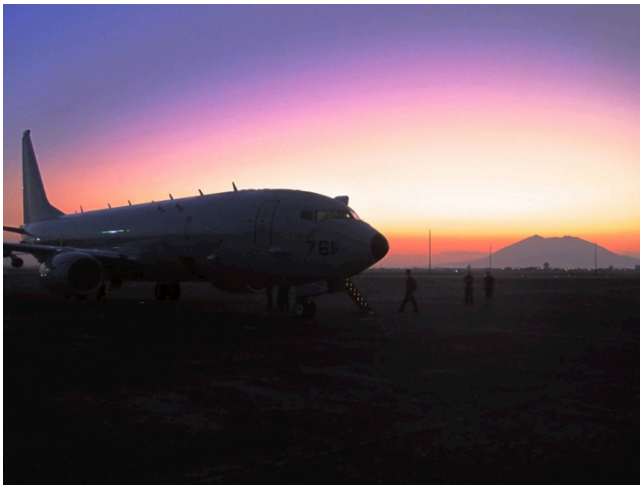
FIGURE 3 CLARK AIR BASE, PHILIPPINES, APRIL 9, 2015. P-8 PARTICIPATING IN EXERCISE BALIKATAN 2015.

In our discussion with Captain Corapi, he discovered how the evolution of the P-8/Triton dyad was subsuming within it several of the earlier capabilities flown by the US Navy to do ASW but was doing so from the standpoint of creating a whole new digital capability, one which could be seamlessly integrated with the air and maritime forces.