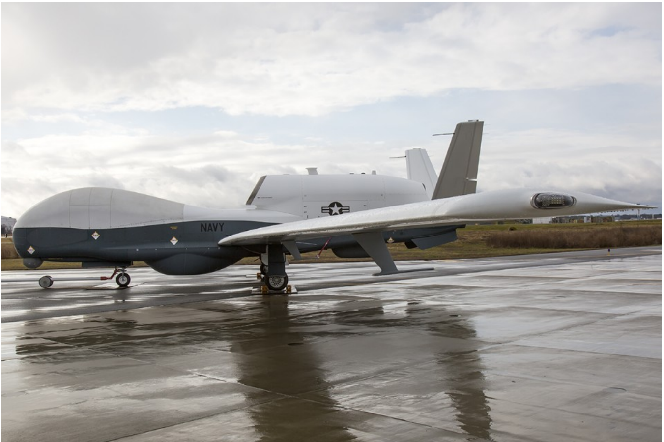
FIGURE 7 TRITON AT PAX RIVER.

This is a visionary foundation for the evolution of the software upgradeable platforms they are flying as well as responding to technological advances to work the proper balance by manned crews and remotes.