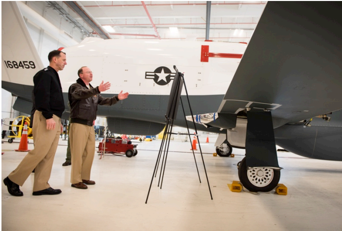
FIGURE 2 CNO ADMIRAL RICHARDSON VISITING NAVAL AIR STATION PAX RIVER JANUARY 13, 2016 AND BEING BRIEFED ON THE TRITON.

The combat learning cycle undergone by the P-8 Wing and by the coming Triton squadrons is convergent with the software upgradeable nature of the new air systems.