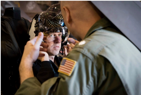
FIGURE 1 CNO ADMIRAL RICHARDSON IN COCKPIT OF AN F-35C AT NAVAL AIR STATION PAX RIVER, JANUARY 13, 2016.

Perhaps it would be better to describe our software approach as one of agile development, of taking a stable foundational software system and evolving its capabilities over time as the plane operates, and inputs come back with regard to what are the most desirable next steps.”