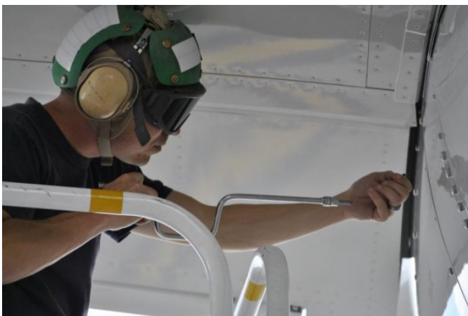
FIGURE 10 MECHANICS WORKING ON P-8. Second Line of Defense

As he put it: “I don’t have children, but if I did I could imagine this would be like having a child and raising it and watching it grow up and go off to college and be successful.”