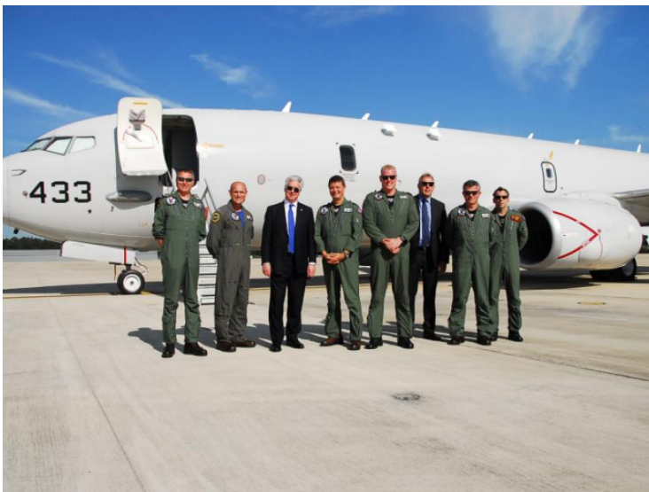
FIGURE 13 UK DEFENCE MINISTER VISITING P-8 SQUADRONS AT JAX NAVY.

Faulds explained that Project Seedcorn consists of 11 RAF personnel (two pilots, four TACCOs and five EWOs) who have trained on U.S. Navy P-8A aircraft embedded with Fleet Replacement Squadron VP-30 personnel since 2012.