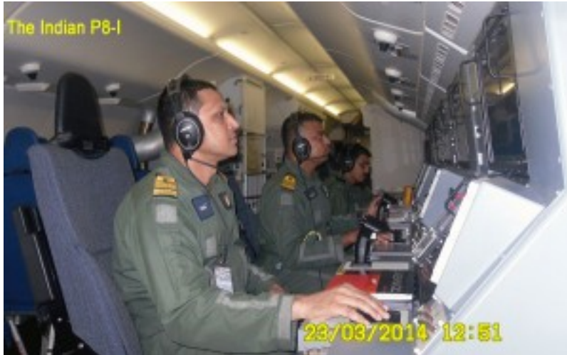
FIGURE 17 INDIAN P-8 DURING SEARCH FOR MALAYSIAN AIRLINES FLIGHT 370.

One of the more intriguing aspects of the attack is how the teams entered Mumbai. Reports indicate at least two of the assault teams arrived from outside the city by sea around 9 p.m. local time. Indian officials believe most if not all of the attackers entered Mumbai via sea.