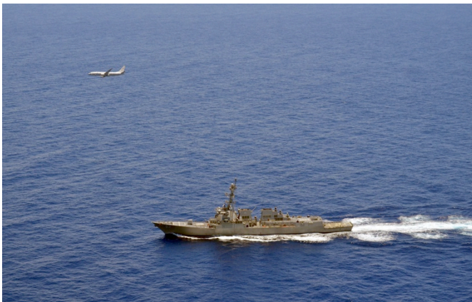
FIGURE 8 P-8 FLIES OVER THE GUIDED-MISSILE DESTROYER USS MOMSEN IN THE SOUTH CHINA SEA JUNE 29, 2016.

The world looks differently at each altitude but by rotating crews, a unique perspective is gained by operating at the different altitudes and with different operational approaches to gain knowledge dominance.”