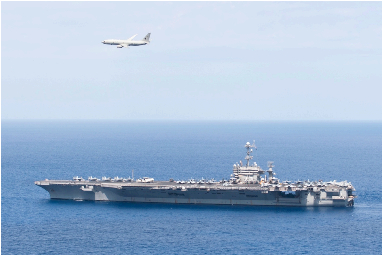
FIGURE 14 P-8 FLIES BY USS HARRY S. TRUMAN OFF OF THE EAST COAST OF THE UNITED STATES, JUNE 25, 2015.

As September drew to a close; so did the Harry S. Truman Composite Training Unit Exercise (COMPTUEX). During the exercise, the "Mad Foxes" of VP-5 and "Fighting Tigers" of VP-8 provided real time support for anti-submarine warfare (ASW), anti-surface warfare (ASuW), and maritime Intelligence Surveillance and Reconnaissance (ISR) to the Carrier Strike Group (CSG) 8.