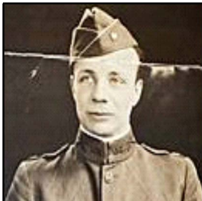
Lt. Col. Ted Roosevelt Jr. in France -1918

Theodore Roosevelt Jr. (H-1909) was the oldest son of President Theodore Roosevelt. After Harvard, he worked in the steel and textile industries before becoming a successful investment banker. With the war clouds on the horizon, he trained in Plattsburg, NY and was commissioned an Army captain in August 1917 and sailed for France in April 1918 with the 26 th Regiment of the 1 st Infantry Division. He fought in numerous campaigns including: Cantigny, the Marne, Noyon-Montdidier defensive, the Meuse-Argonne offensive and at Soissons where he was wounded and gassed in May 1918. By the summer of 1918, Ted had been promoted to lieutenant colonel and appointed as a battalion commander. After too many damp days in water-logged trenches, Ted developed severe arthritis, which would plague him for the rest of his life. For his bravery and leadership, Ted was also awarded the Legion d'Honneur and the Croix de Guerre. Translated from French, the citation for his awards reads: Major Theodore Roosevelt Jr. Commanding Officer of the 1 st Battalion, 26 th American infantry regiment reflects the energy and enthusiasm of his battalion. Despite a poison gas attack, he remained at this post and successfully directed the resistance against a German counter attack. In a moment notice on 29 June 1918, he organized a raid against the enemy position which he executed under sustained close enemy fire "