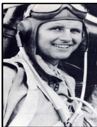
Lt. Joe Kennedy USNR

Joseph Kennedy (H-1938) was born in Hull (MA) as the oldest son of Joseph Patrick Kennedy (H-1912) and the brother of President John F. Kennedy (H-1940) and former Attorney General Bobby Kennedy (H-1948).