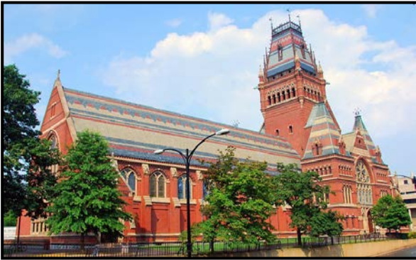
Memorial Hall at Harvard

There are at least 37 memorials at Harvard for alumni who died for our country while on active military service. The 2 most prominent & widely known sites honoring veterans are Memorial Hall and nearby Memorial Church located in the heart of Harvard Yard. Memorial Hall was completed in 1877 to commemorate the 117 casualties from Harvard who fought in the Union Army during the Civil War.