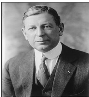
Col. Dwight Davis USA

The Legion d'Honneur was established by Napoleon and is the highest award in France for both military and civil service to France. A military based induction into the Order of the Legion d'Honneur is almost equivalent to the Victoria Cross (UK) and the Medal of Honor (US). During World War I, at least 18 Harvard graduates received the Legion d'Honneur from the French government of whom 14 also were simultaneously awarded the Distinguished Service Cross or the Navy Cross and 3 others also were recipients of the Silver Star. Among the more notable in this group were: the namesake of the Davis Cup, the founder of the Lafayette Escadrille in France, a son of a president of the United States and the American "Ace of Aces".